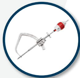
TWISTR™ Retrograde Reamer & Cruciate+ Instrumentation