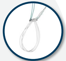
RIGIDLOOP™ Adjustable Cortical System