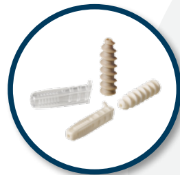
INTRAFIX™ ADVANCE Tibial Fastener System