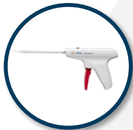
TRUESPAN™ Meniscal Repair System