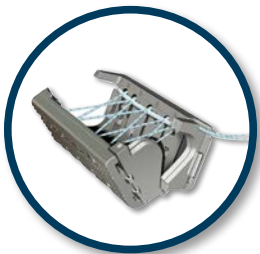
SPEEDTRAP™ Graft Prep System

At DePuy Synthes Mitek Sports Medicine, we know that every second is valuable in your OR. That's why we are enhancing our commitment to streamlined and reproducible procedures. From graft preparation, meniscal repair, and retrograde reaming to femoral and tibial implants, Mitek Sports Medicine now offers an all-star lineup of solutions for your cruciate ligament reconstructions and meniscal repairs. Together with our comprehensive portfolio of precision instruments, we've got the solutions you need for a more efficient OR.